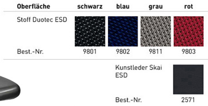
Abbildung in Kunstleder Skai ESD

The ESD chair by Bimos Unitec 2 is equipped with castors and a steel base. In addition, the chair is naturally height-adjustable and back-friendly thanks to the permanent contact backrest. The ESD chair is conductive according to DIN EN 61340-5-1.